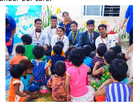
From IIHM, when physical visits with permission was allowed.

We are privileged to have the support of our friends and well wishers who have stood by us to see us through the difficult days of the pandemic. Some of our staff members worked throughout the pandemic so that no child under our care is deprived of shelter or care. Our care givers continued to come to work. Now our entire staff is vaccinated and they continue to do their best for the children who are under our care.