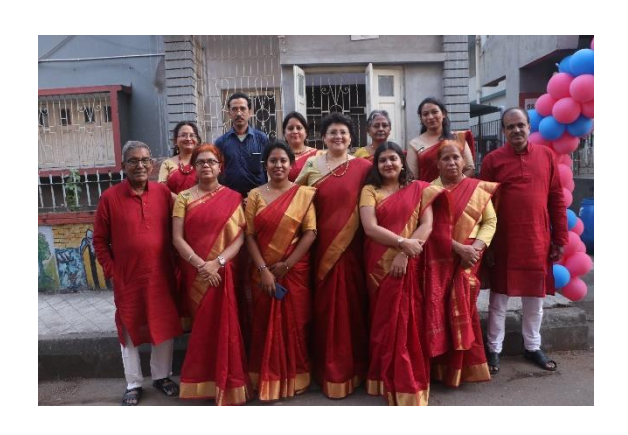
The ISSA Team in 2019