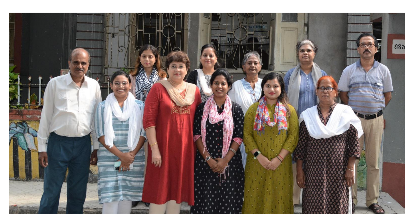
ALL OF US AT ISSA EXPRESS OUR GRATITUDE TO OUR MEMBERS AND WELL WISHERS